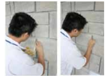
L. Caulk and Brush Colored Paint.