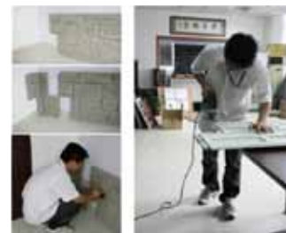
H. Measure and Cut