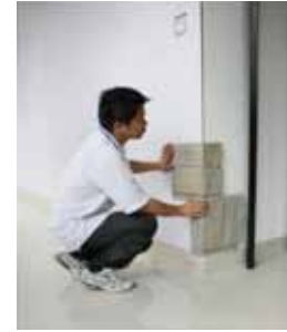
D. Reinforce With Nails