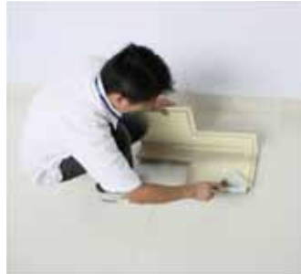
C. Brush Glue