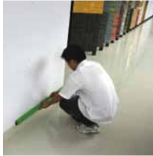
A. Draw Horizontal Line