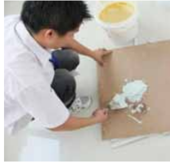
B. Mix Glues