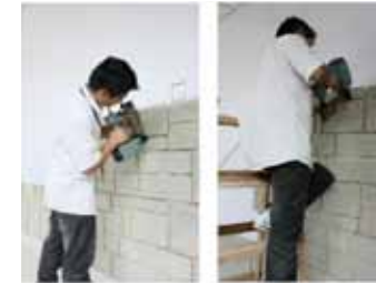
K. Reinforce with Steel Nails in Differing Height.