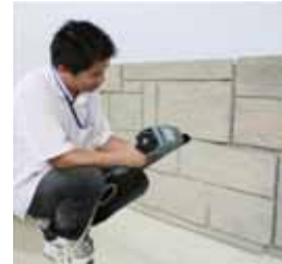
F. Reinforce With Nails